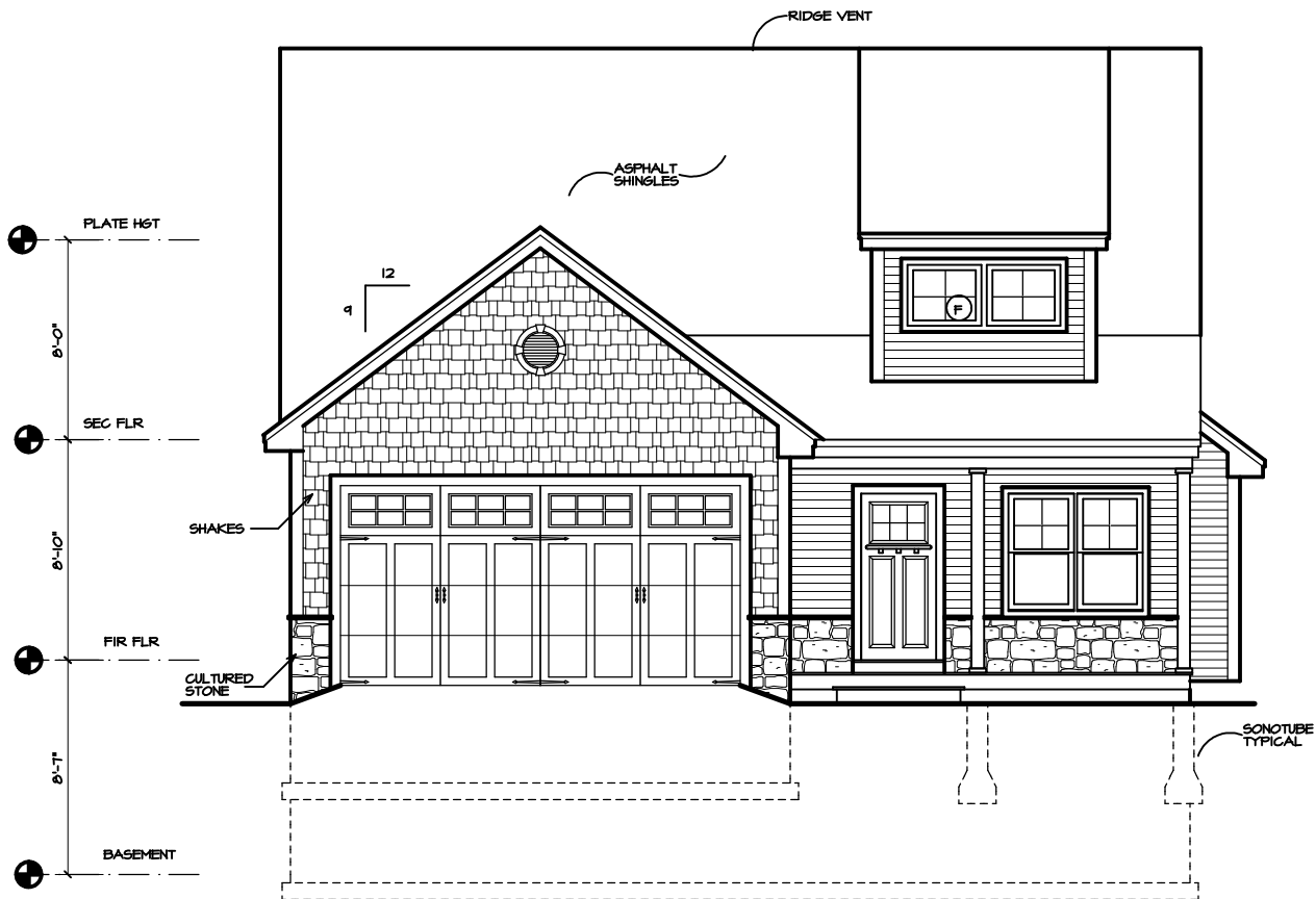
1 FRONT ELEVATION AI SCALE: 1/4" = 1'-0"